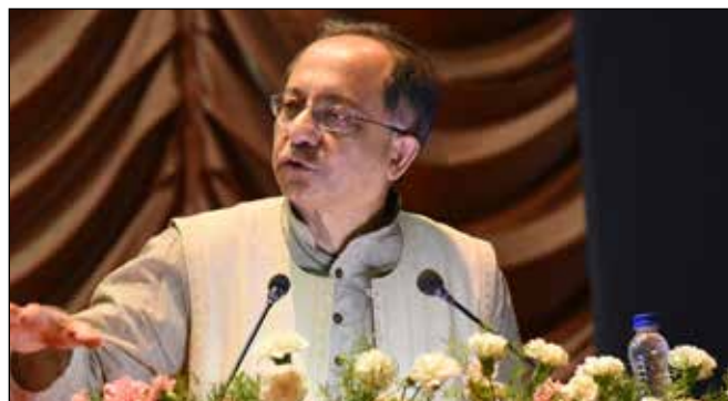
Prof. Kaushik Basu delivers the valedictory address and expresses his gratitude to all concerned for the successful conclusion of the 98th annual conference