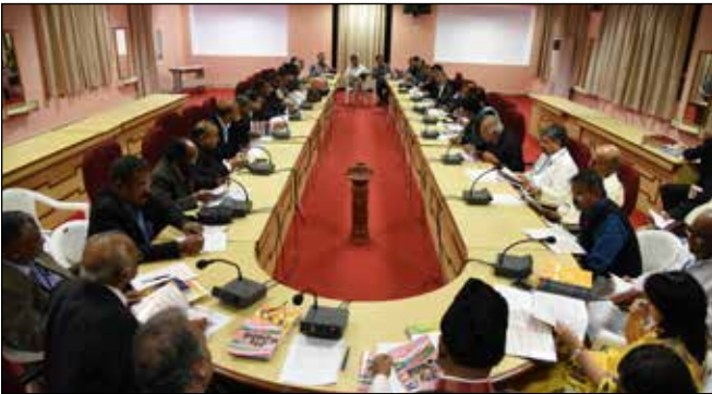
EC members going through the Annual Report 2014-15 of the General Secretary and Treasurer during the EC meeting