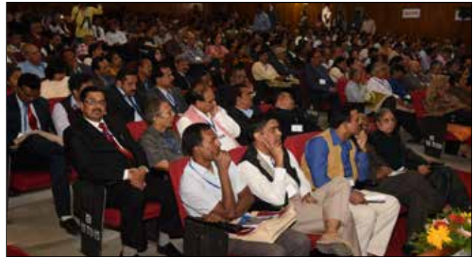
Members of the IEA watch in progress the inaugural ceremony and release of IEA members' publications