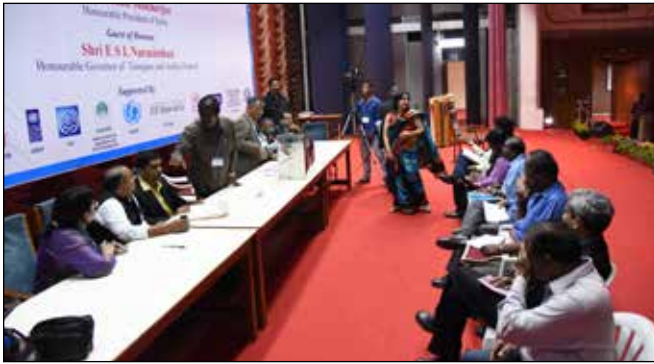
Election officers and candidates during the counting process of IEA Elections 2015