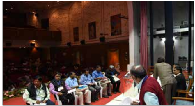
Votes being read out and communicated to the candidates during the Election counting process