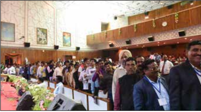
Members of the IEA queued up to cast their vote during the IEA Elections 2015 held on 29 December, 2015 at PJTSAU, Hyderabad