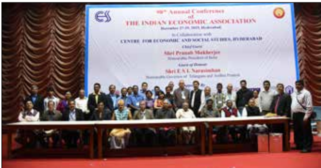
Winning candidates, election officers and other members of the IEA after the conclusion of the counting process in IEA Elections 2015