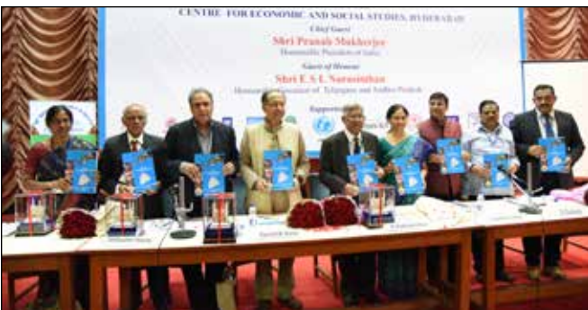
Dignitaries on the dais release CESS Publication—Status of MDGs in Telangana state