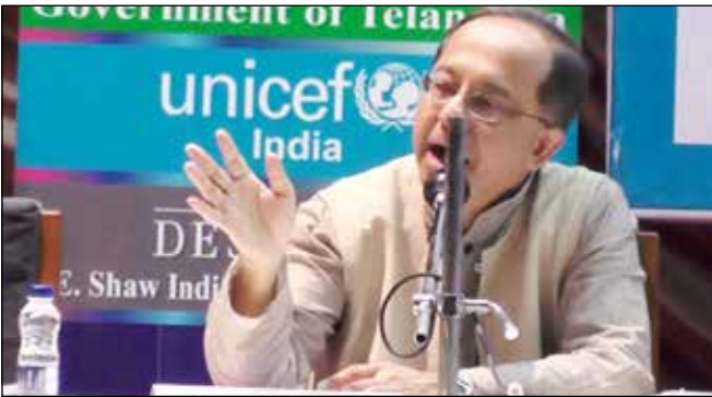
Prof. Kaushik Basu, Chief Economist and Sr. Vice President, World Bank delivering the Chairperson's remarks during the panel discussion on Higher education in globalizing world