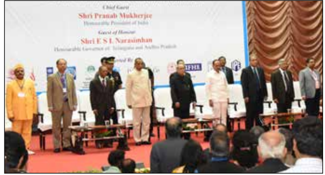
Hon'ble President of India and other delegates on and off the dais rise for the National Anthem to mark the beginning of the Inaugural function of the 98th Annual Conference