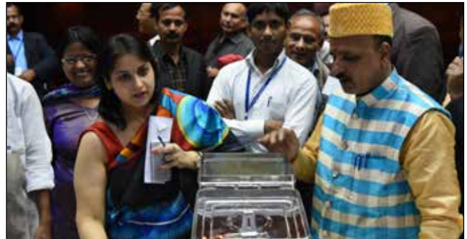
Material of IEA Elections 2015 being sealed away after the successful conclusion of the election process