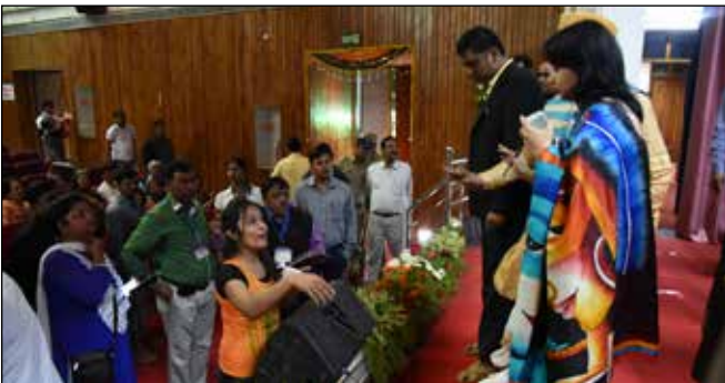
Some candidates and their family members entering into arguments and abuses with the election officers and General Secretary and Treasure in an attempt to disrupt the election process