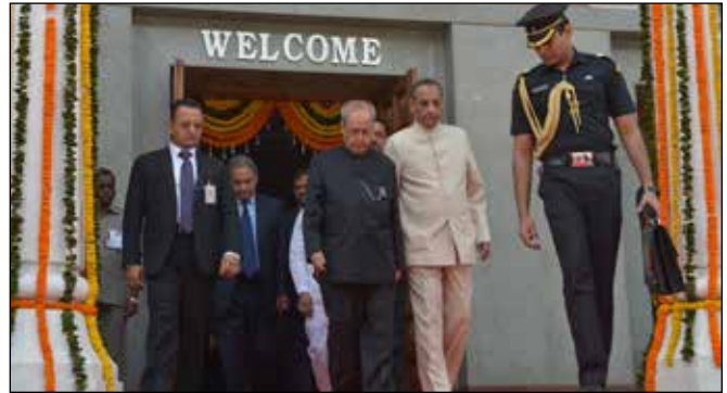
Hon'ble President of India, Sh. Pranab Mukherjee and E. S. L. Narasimhan, Hon'ble Governor of Telangana departing after inaugurating the 98th Annual IEA Conference