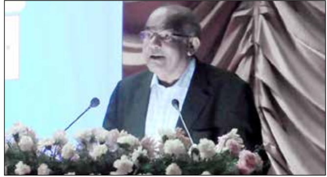
Dr. Y.V. Reddy, Chairman, 14th Finance Commission and Former Governor, RBI delivering the chairperson's remarks during the NSE Special Lecture