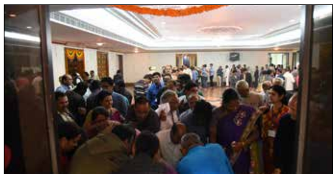
Members queued up during the distribution of conference materials and 2013, 14 e-IJ during the evening of day one of the 98th Annual IEA Conference