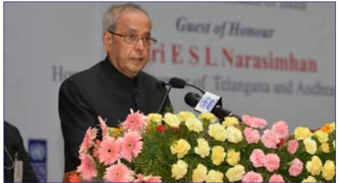
Hon'ble President of India, Sh. Pranab Mukherjee addressing the delegates at the inaugural function of the 98th Annual IEA Conference