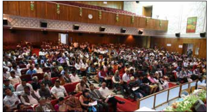
Members in discussions among themselves during the General Body Meeting of IEA