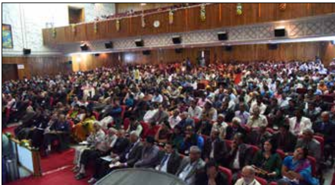
Delegates participating on day 1 of the 98th Annual Conference of IEA at Hyderabad