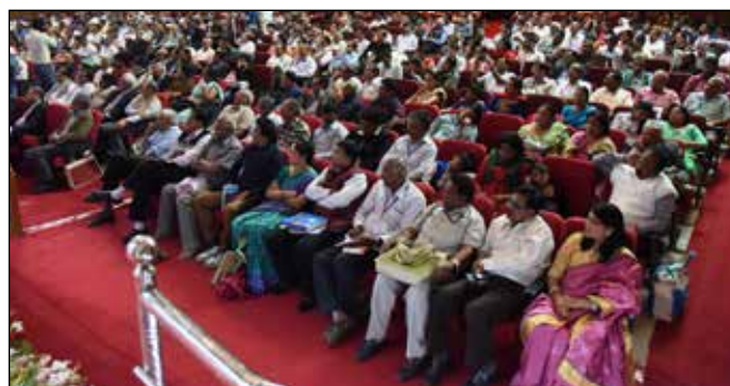
Member delegates attending the valedictory function of the 98th annual IEA conference