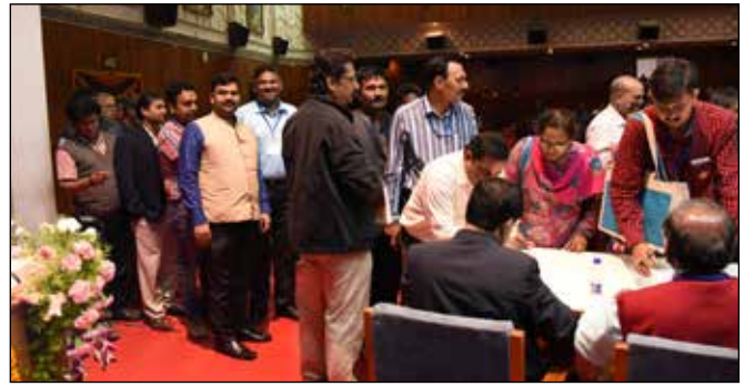
Members of the IEA wait for their turn to receive the ballot papers from the Election Officers