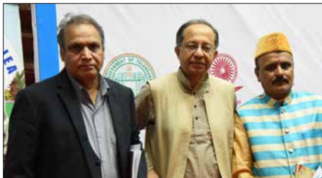
IEA President Prof. Sukhadeo Thorat, Conference President Prof. Kaushik Basu and IEA General Secretary and Treasurer, Dr. Anil Kumar Thakur share a moment together during the 98th annual conference