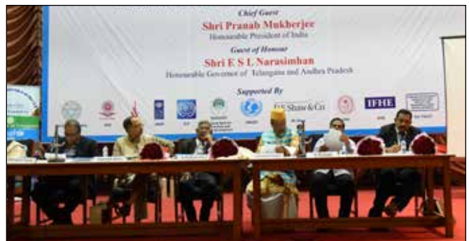
Dignitaries on the dais during the valedictory function of the 98th annual IEA conference