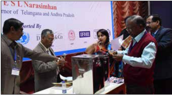
Final votes being cast by the team of election officers during IEA Elections 2015 at Hyderabad