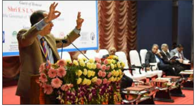
Prof. Kaushik Basu, Conference President IEA and Chief Economist, Senior Vice President, World Bank delivering the Presidential Address during the inaugural ceremony of the 98th Annual IEA Conference