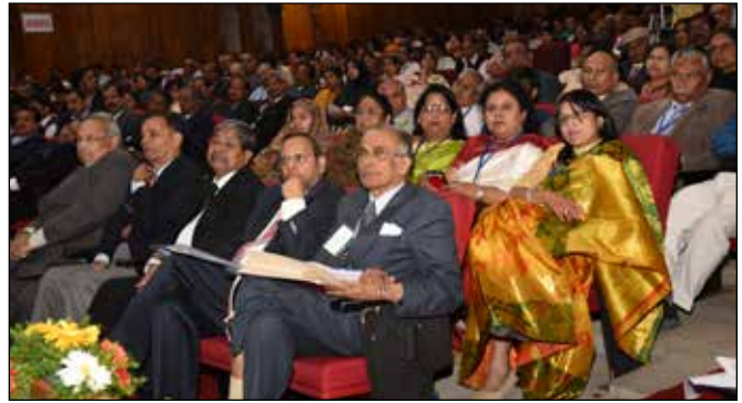
Members of the IEA seated as a packed audience during the Inaugural Ceremony of the 98th Annual IEA Conference