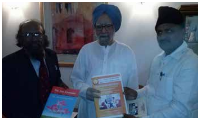
Hon'ble Former Prime Minister of India, Dr. Manmohan Singh, releasing the Indian Economic Association Newsletter 2015 at his official residence