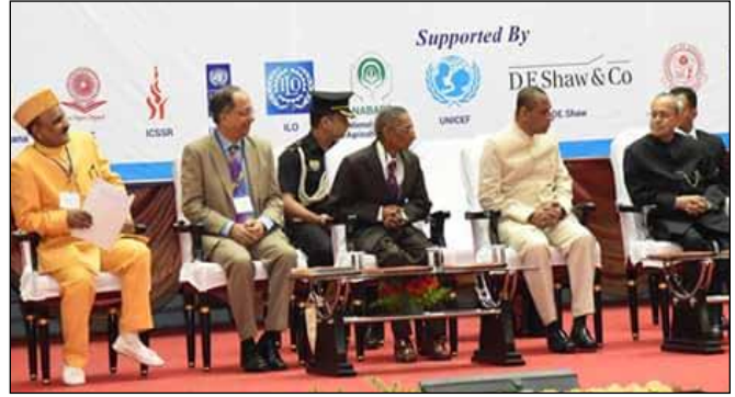
Hon'ble President of India, Sh. Pranab Mukherjee; Hon'ble Governor of Telangana and office bearers of IEA sitting on the dais on the eve of Inaugural function of 98th Annual Conference of the IEA