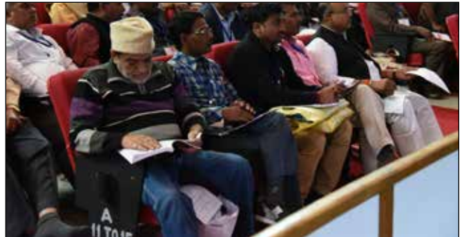
Members of the IEA attending the GBM in large number in Hyderabad