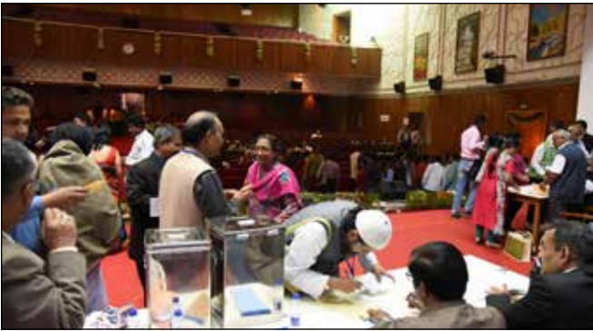
Members of IEA place the ballot paper, upon casting their votes, in sealed boxes during IEA Elections 2015 at Hyderabad