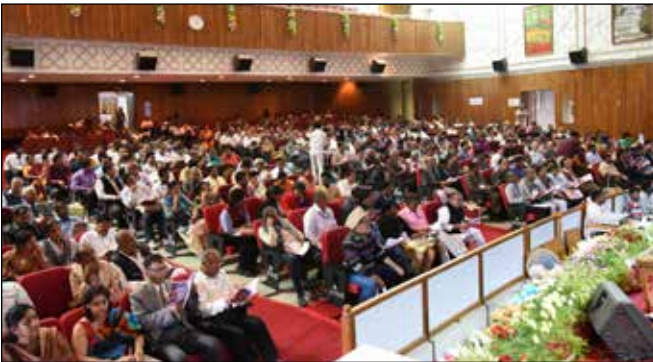
GB members going through the Annual Report 2014-15 of the General Secretary and Treasurer of IEA