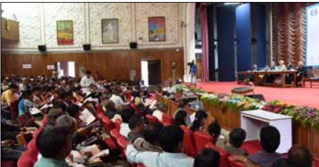
General Body Meeting of the IEA in progress on 29th December, 2015 at PJTSAU, Hyderabad