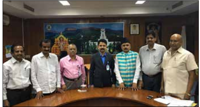
Members of the Organising Committee rise for the National Anthem to mark the beginning of the meeting for 99 th Annual Conference of the IEA