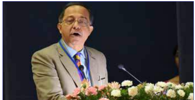
Prof. Kaushik Basu, Conference President and Chief Economist, Sr. Vice President, World Bank delivering his remarks during the Inaugural Function