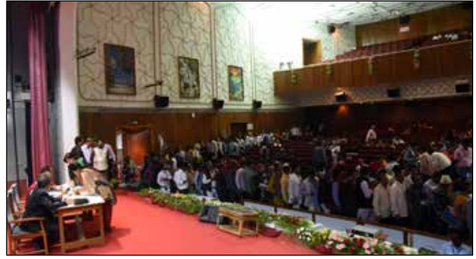
Members of the IEA casting their vote during IEA Elections 2015